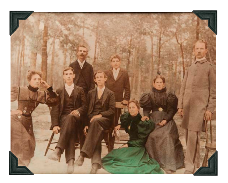
One of our oldest photos in the University archives show Campbell faculty in 1887; opposite page, a student admires a diploma from the original Buies Creek Academy.

In the library world, archival reading rooms are the portal to the magic of archives.